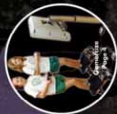
Freedom Climber Page 10