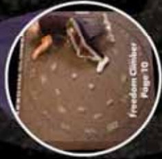
Freedom Climber Page 10