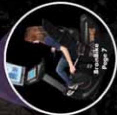
Freedom Climber Page 10