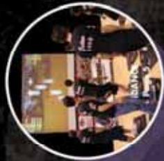
Dots Page 6