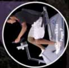
Freedom Climber Page 10