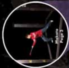
Plank Page 9