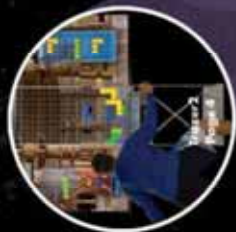
Freedom Climber Page 10