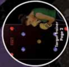
Freedom Climber Page 10