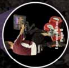
Freedom Climber Page 10