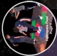
Lightness Floor Page 4