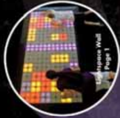
Lightness Wall Page 1