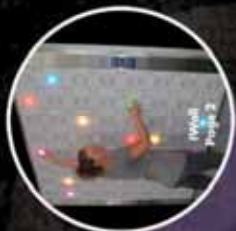
Wall Page 2