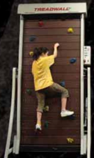
*M4 Pro allows variable climbing angles